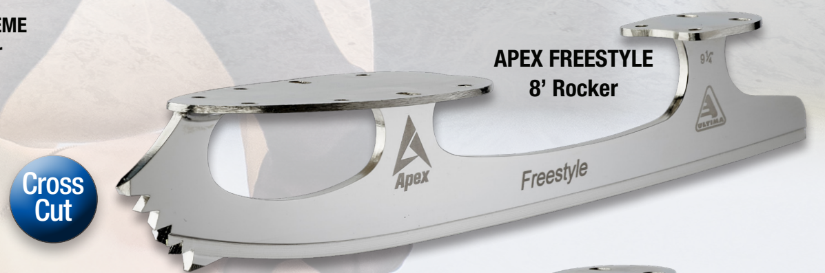
APEX FREESTYLE 8' Rocker