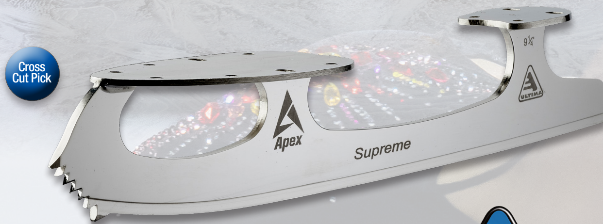
APEX SUPREME 8' Rocker