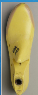
Jackson Regular Last