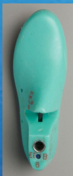
Jackson Wide Last