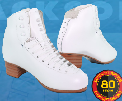
SUPREME 5430 LOW CUT