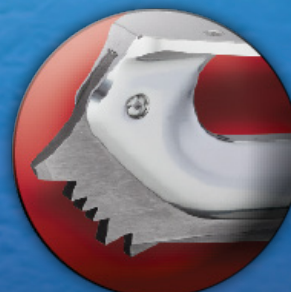
Straight Cut Pick 8' Rocker