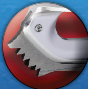
Cross Cut Pick 8' Rocker