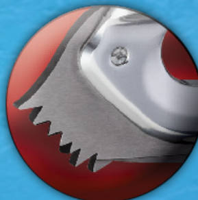
Cross Cut Pick 7' Rocker