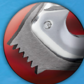
Cross Cut Pick 8' Rocker