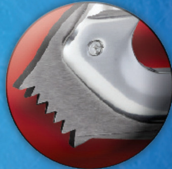
Cross Cut Pick