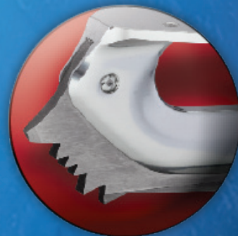
Straight Cut Pick